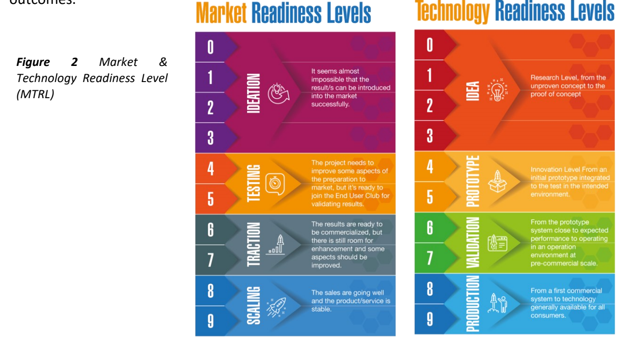
www.cyberwatching.eu - @cyberwatchingeu

The "Market & Technology Readiness Level" (MTRL) methodology was developed by cyberwatching.eu to evaluate how close projects are to the market. The MTRL is introduced as a complementary methodology to "Technological Readiness Level" (TRL) to assess projects' outcomes.