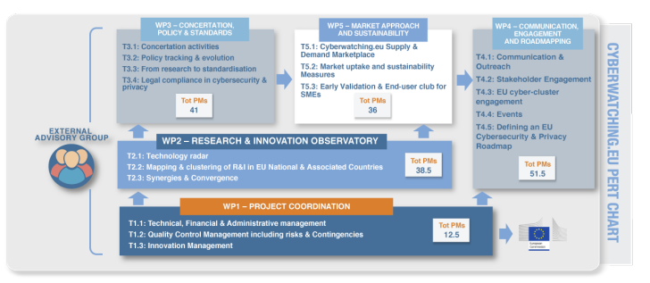
Figure 1 - WP3 playing a key role in cyberwatching.eu

The idea is that the concertation can gather content from the related project to populate the related reports in WP3 around thematic areas including: i) Policy, ii) Research to Standardisation and iii) Legal Compliance. The goal is to have a clustered effort of content, made up of the above that can serve as valid, reference sourced reports for the use of the funding agencies, the projects themselves, future initiatives and member state achievements.