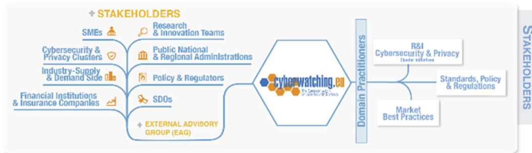
Figure 2 – Cyberwatching.eu stakeholders

The figure below, taken from the Grant Agreement is a snapshot of the variety of stakeholders involved in the complete ecosystem. For the purpose of the agenda we have included a table that acknowledges what the stakeholders will get out of the concertation event.