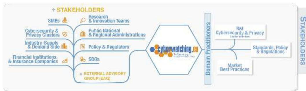
Figure 2 – Cyberwatching.eu stakeholders

The figure below, taken from the Grant Agreement is a snapshot of the variety of stakeholders involved in the complete ecosystem. For the purpose of the agenda we have included a table that acknowledges what the stakeholders will get out of the concertation event.